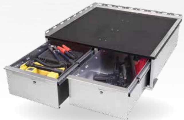
Dual drawer unit