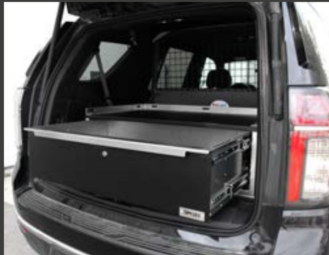
Premium Single Drawer