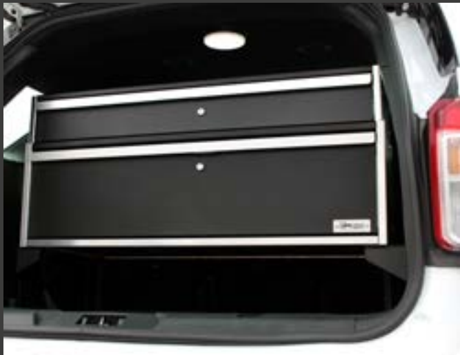
Pursuit Series Dual Stacked Drawer