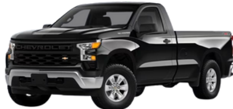
GMC/CHEVY PICKUP TRUCK