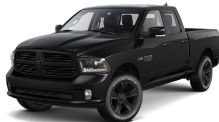
RAM PICKUP TRUCK