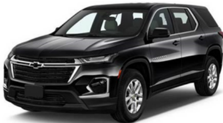
SPECIALTY UNMARKED SUVS