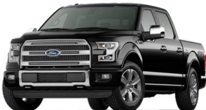
FORD PICKUP TRUCK